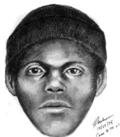
African American Male 19-25 years old 5'11"-6'0" Medium Complexion, smooth skin lanky in appearance.

We believe there are other persons who may have survived attacks by this same suspect or may have information regarding this suspect and these attacks