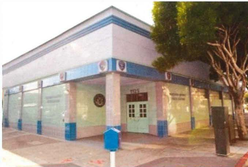
Northern Police Station Turk / Fillmore