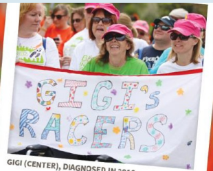
GIGI (CENTER), DIAGNOSED IN 2010

REGISTER TODAY! WALKMS.ORG | 1-855-372-1331