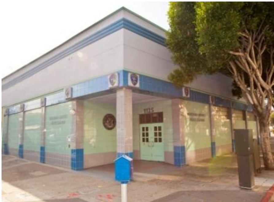
Northern Police Station Turk / Fillmore

Petty Theft – Theft where the value of the property taken is less than $950.