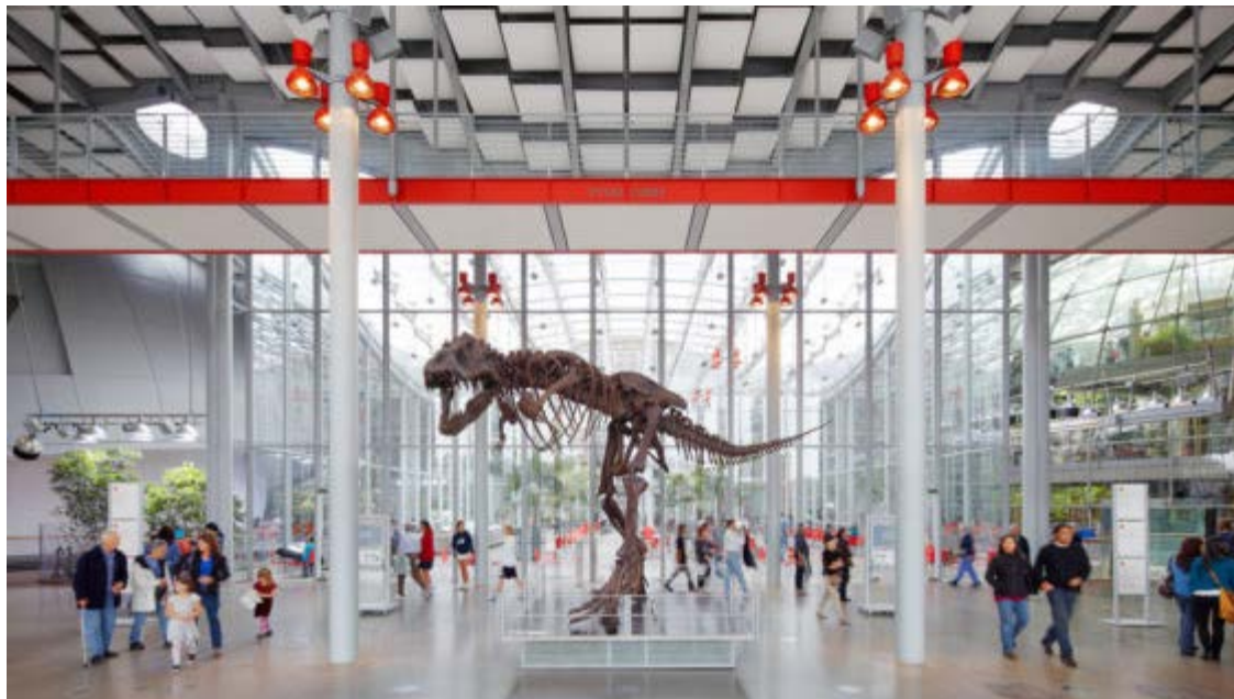
California Academy of Sciences